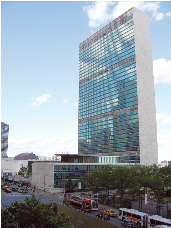
◀ Headquarters of the United Nations in New York City, USA.

Agenda 21 (explained below) is being carried out by NGOs. For example, the New Israel Fund (funded by the Ford Foundation and others) as well as such groups as George Soros' Open Society Foundations and Oxfam. The intention, I surmise, is to destroy Israel from within like other Western countries.